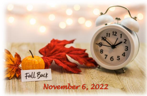
November 6, 2022